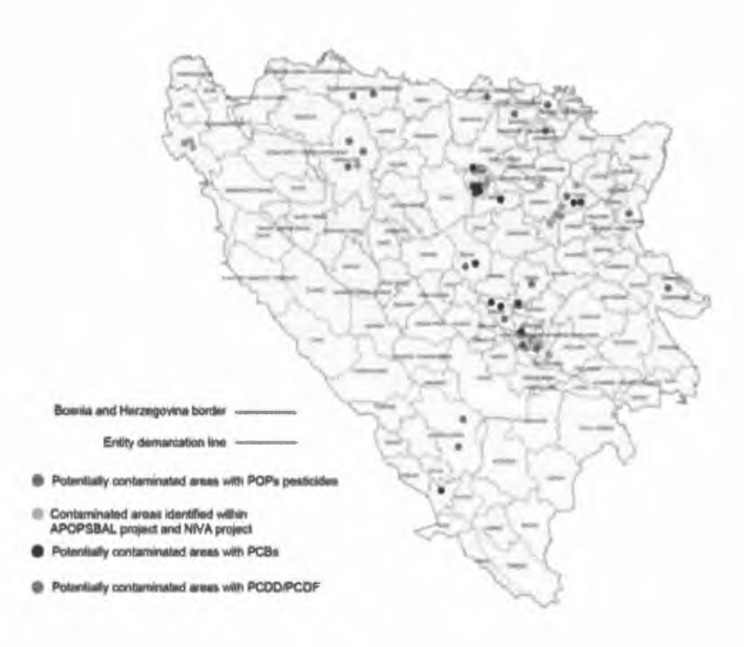
Figure 1 - Identified contaminated areas and hot-spots in BiH according to NIP

Figure 1 presents geographical distribution of industrial facilities identified as the potential hotspots according to NIP.